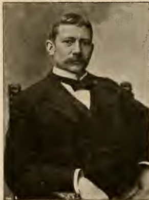
ELIHU ROOT, Secretary of War.

I beg to join with the people of Kansas in welcoming to their homes these citizen-soldiers, so worthy of the heroic origin and patriotic history of their state.